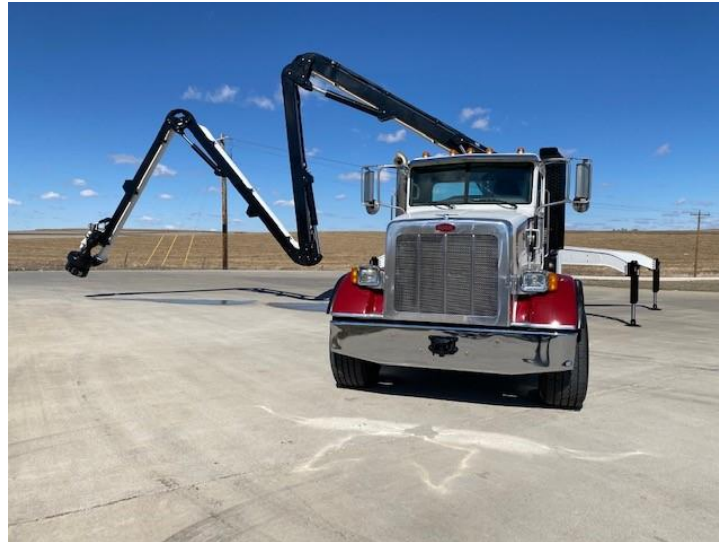
Boom Truck – 70 Feet of Reach - 3600 GPM