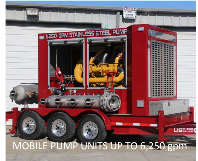
MOBILE PUMP UNITS UP TO 6,250 gpm