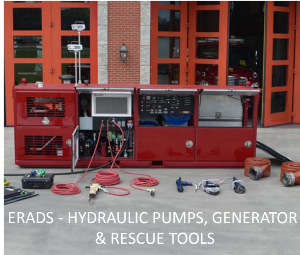
ERADS - HYDRAULIC PUMPS, GENERATOR & RESCUE TOOLS