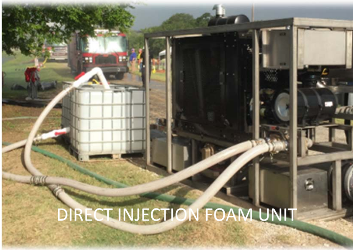
DIRECT INJECTION FOAM UNIT