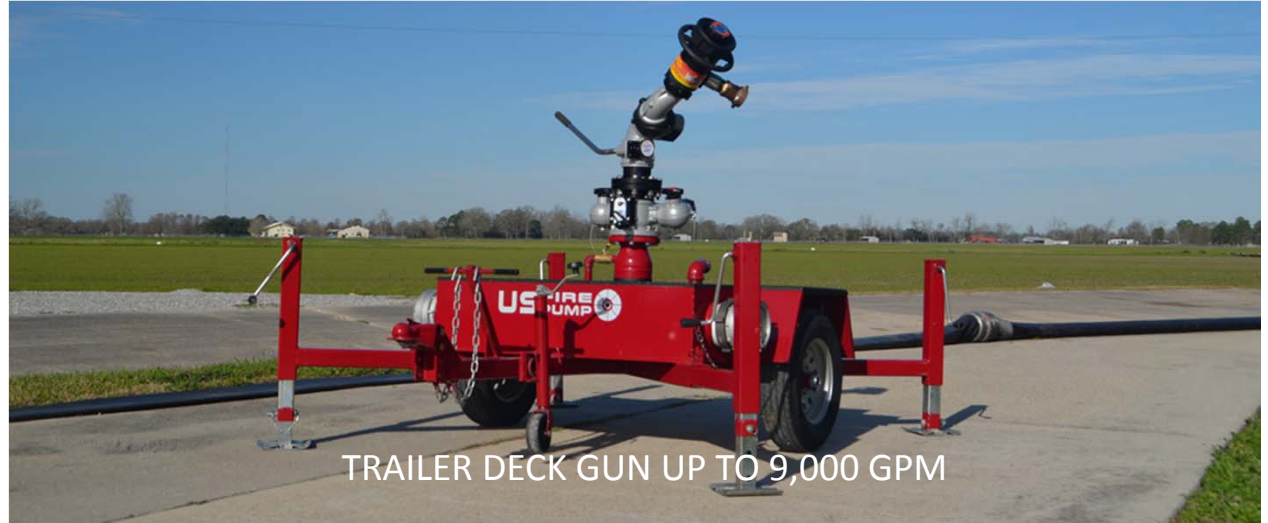
TRAILER DECK GUN UP TO 9,000 GPM