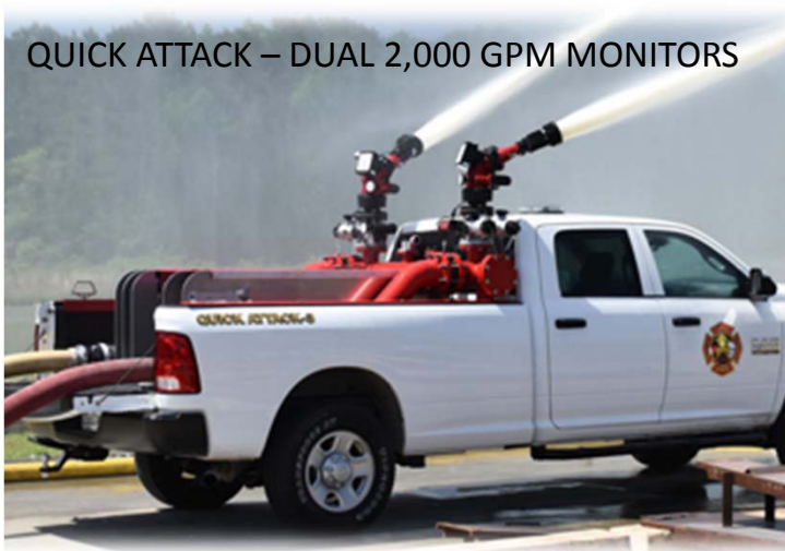
QUICK ATTACK – DUAL 2,000 GPM MONITORS