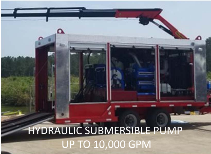
HYDRAULIC SUBMERSIBLE PUMP UP TO 10,000 GPM